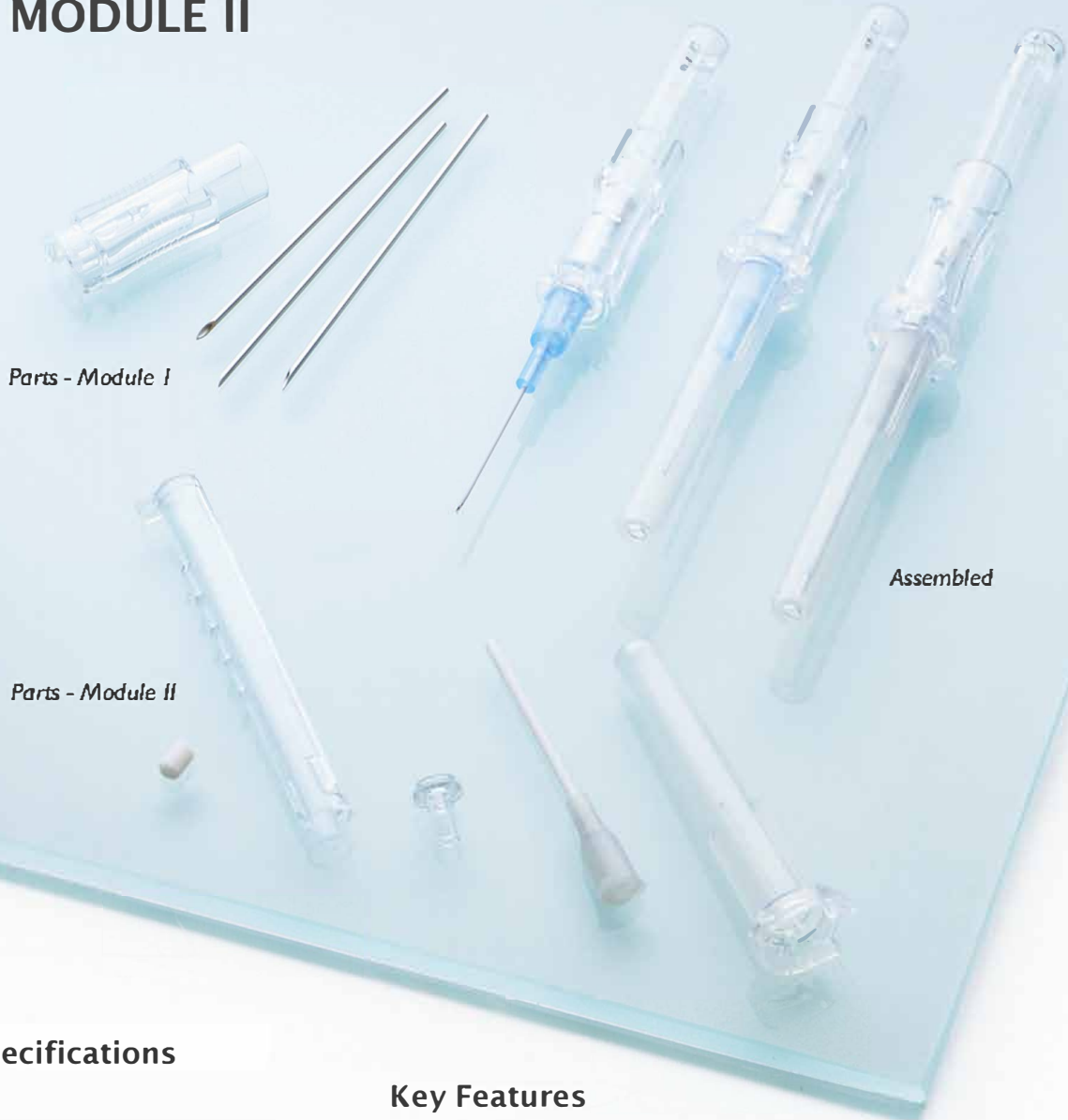
Parts - Module I